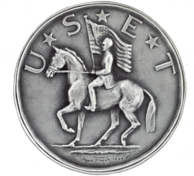
The early USET medals.

In 1982, the Program incorporated year-end Finals as a further goal and in 1994 the USET decided to change the name of the USET Medal Program to the USET Show Jumping Talent Search Program.