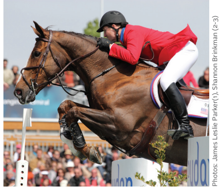
The Talent Search Program is a proven pipeline of helping riders to develop their show jumping skills while laying groundwork for future international success. McLain Ward (pictured above) won the Finals East in 1990 and is now a two-time Olympic Gold Medalist!