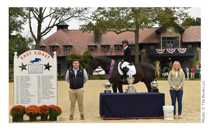
WINNER OF THE GRAPPA TROPHY

2019 PLATINUM PERFORMANCE/USEF SHOW JUMPING TALENT SEARCH FINALS EAST BEST HORSE AWARD